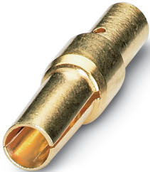
Crimp contact, turned, contact diameter: 2 mm, crimp range: 1.5 mm 2 ... 2.5 mm 2

Please be informed that the data shown in this PDF Document is generated from our Online Catalog. Please find the complete data in the user's documentation. Our General Terms of Use for Downloads are valid ( http://phoenixcontact.com/download )